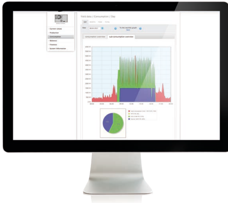
Graph of the daily consumption from the connected appliances.

The Solar-Log™ menu structure provides an intuitive user interface. This new structure allows smart electrical appliances, such as an AC ELWA 2 in combination with Smart Plugs, to be controlled and prioritized based on the amount of surplus power. Different energy profiles and components can be linked and checked based on the simulation.