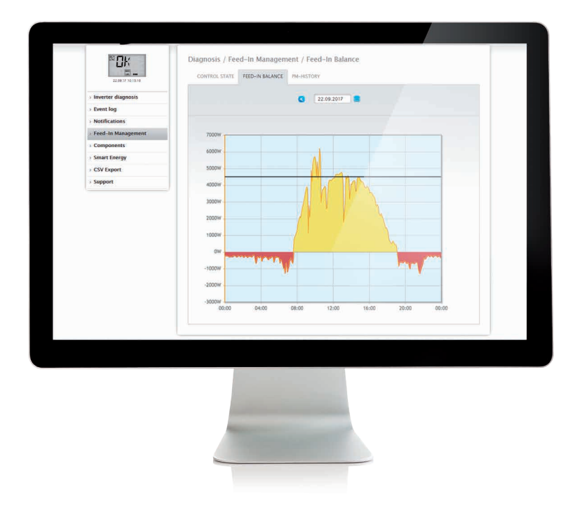
Feed-in management - feed balance: The times when there was a grid feed and when electricity was purchased from the grid can be seen at a glance in this graph. Negative (red) values indicate that electricity was purchased from the grid and positive (yellow) values that there was grid feed.

When used with the Solar-Log WEB Enerest<sup>™</sup> XL and either the SCB, the Solar-Log 1900 monitors every single string, ensuring the most complete and secure monitoring for large-scale PV plants with exact error identification and localization.